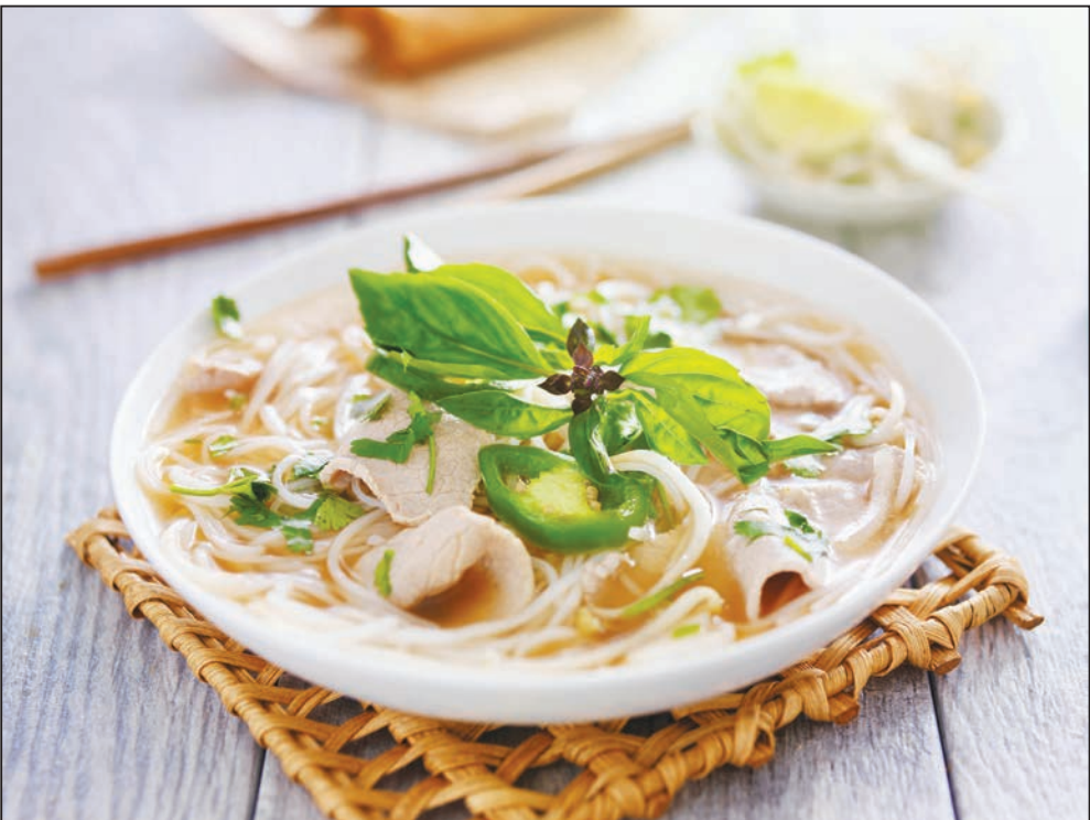
A steaming bowl of Vietnamese Beef Pho is the perfect take-out meal to bring to a sick friend.

We searched for dietary remedies from other cultures and found many broth-based ones. If you’re not up to making soup, you can find many options at local restaurants. Our first choice would be Vietnamese Pho. If you order this to go, you’ll receive a container of broth with the noodles, toppings, and seasonings