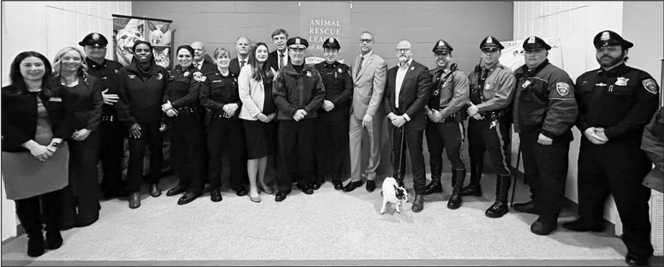
Area police, officials gather for the Suffolk County DA announcement of the creation of the county’s first Animal Cruelty Task Force.