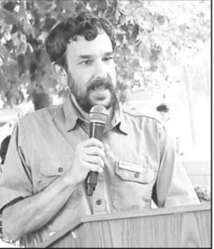
Winton Pitcoff, Deputy Commissioner of MDAR addresses the crowd and reads the proclamation from Massachusetts Governor Maura Healey, proclaiming the week of August 6-12 as Massachusetts Farmers Market Week. Pitcoff stated there are 200 farmers markets in Massachusetts, including 50, that run through the winter.