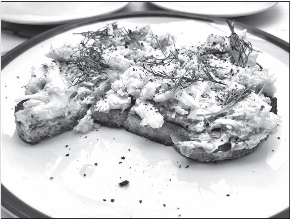
This crab toast is a perfect example of using the best you can buy and knowing when to stop adding ingredients to a dish.

come a trendy food and diet theme. In some cases, creators of simplified recipes will allow a few basic additions like a fat, an acid, salt, and pepper. This rule is also a good guideline if you buy prepared foods. If the ingredient list is long and contains chemicals and additives, look for a better choice. Some find that eating more 5-ingredient meals helps with weight control. It makes sense since we know that ultra-processed and junk foods are significant factors in the obesity epidemic.