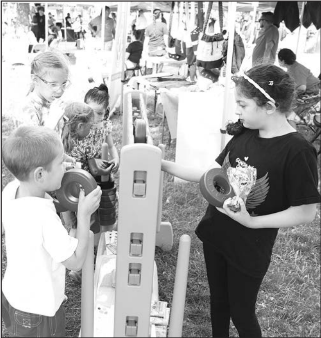
There was plenty to keep the children busy, while mom and dad shops for fresh fruits and vegetables.