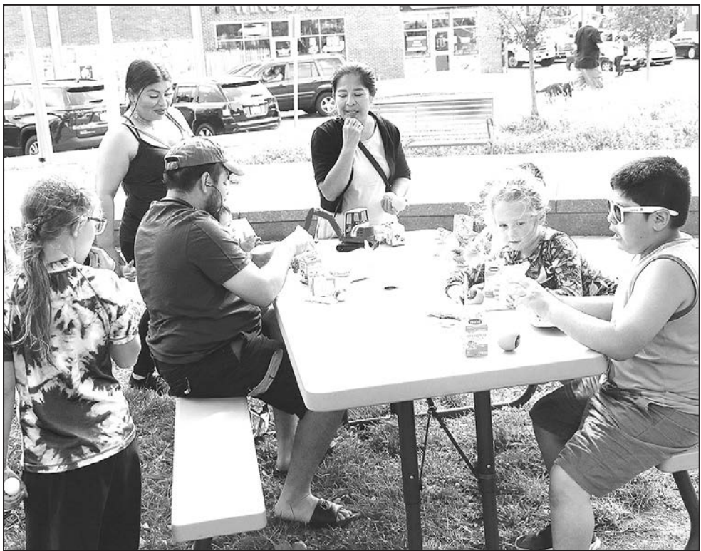
Free lunches for the children were provided.