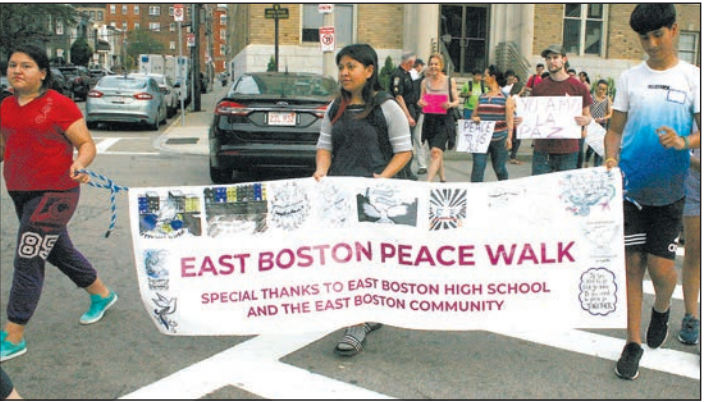
Local teens hold the East Boston Peace Walk banner.