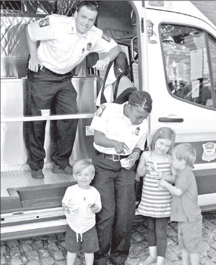
Boston Police Ice Cream Truck Cadets giving free ice cream to children.