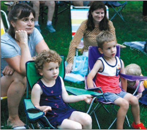
Eastie families get ready for movie night in Brophy Park.