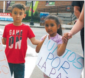
People of all ages are encouraged to join the weekly Peace Walks that take place each Thursday at 6 p.m.