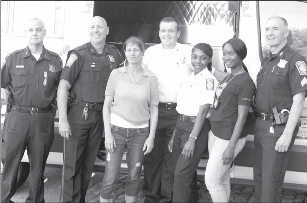
Boston Police contingent.