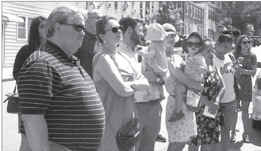
The extended Downing family during the ceremony.