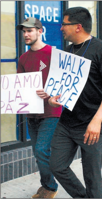
Residents join in to the weekly Peace Walk.