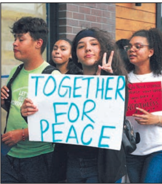
Last week's Peace Walk drew a lot of teens.