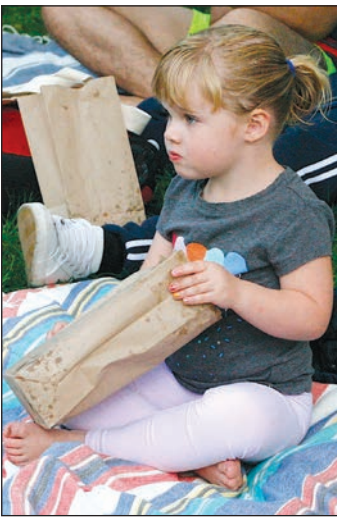
With popcorn in hand this young Eastie resident was ready for the movie.