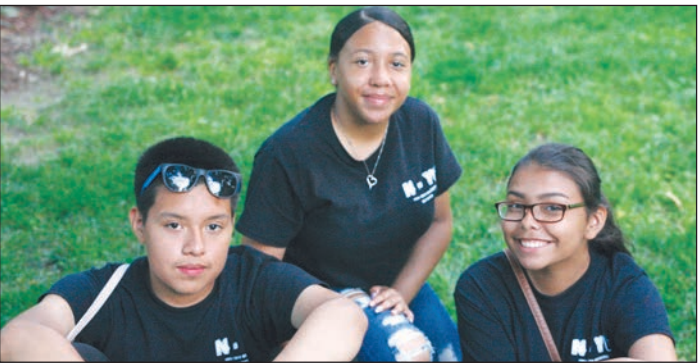
The YMCA helped provide activities for the kids.