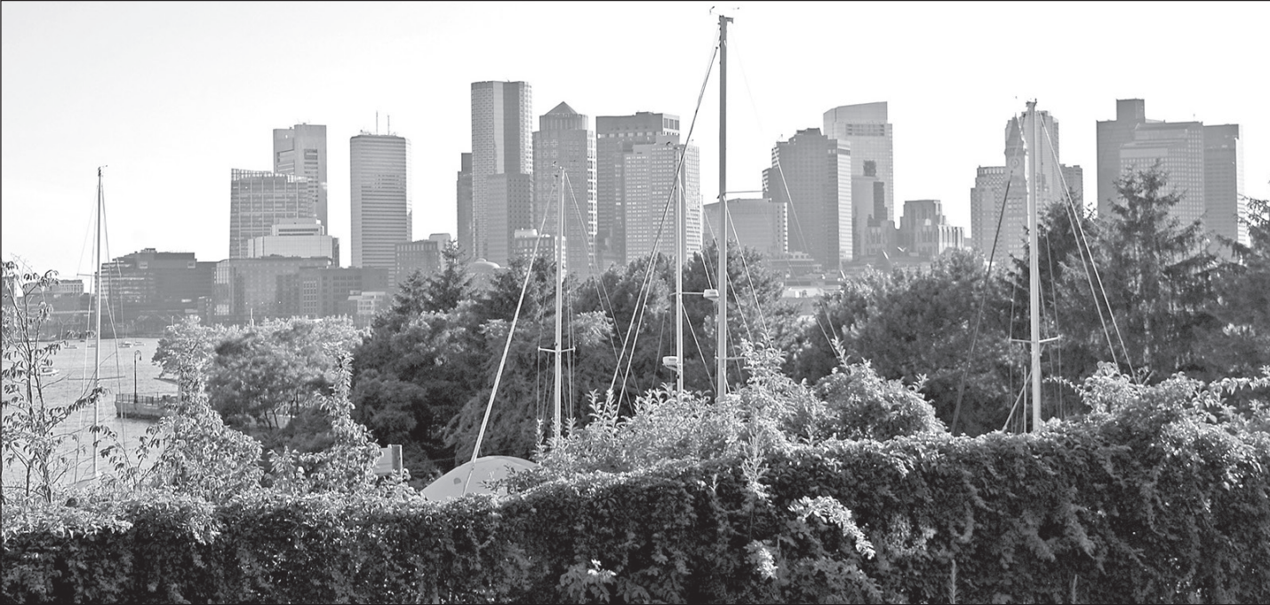
The Boston skyline from the Terrace.