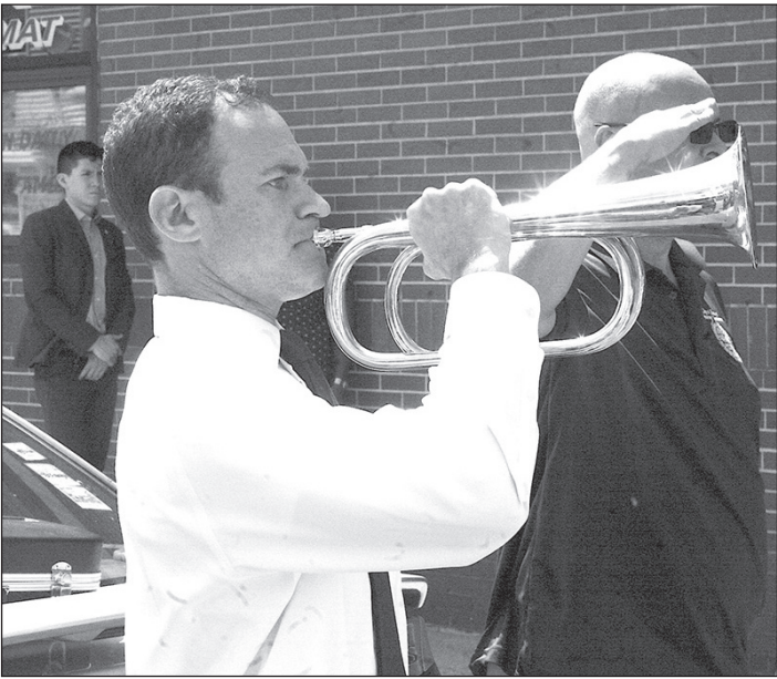
"Taps" was played as part of the ceremony.