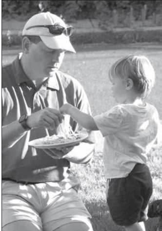
Young partygoer with his father.