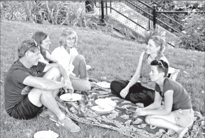
Time for a picnic.