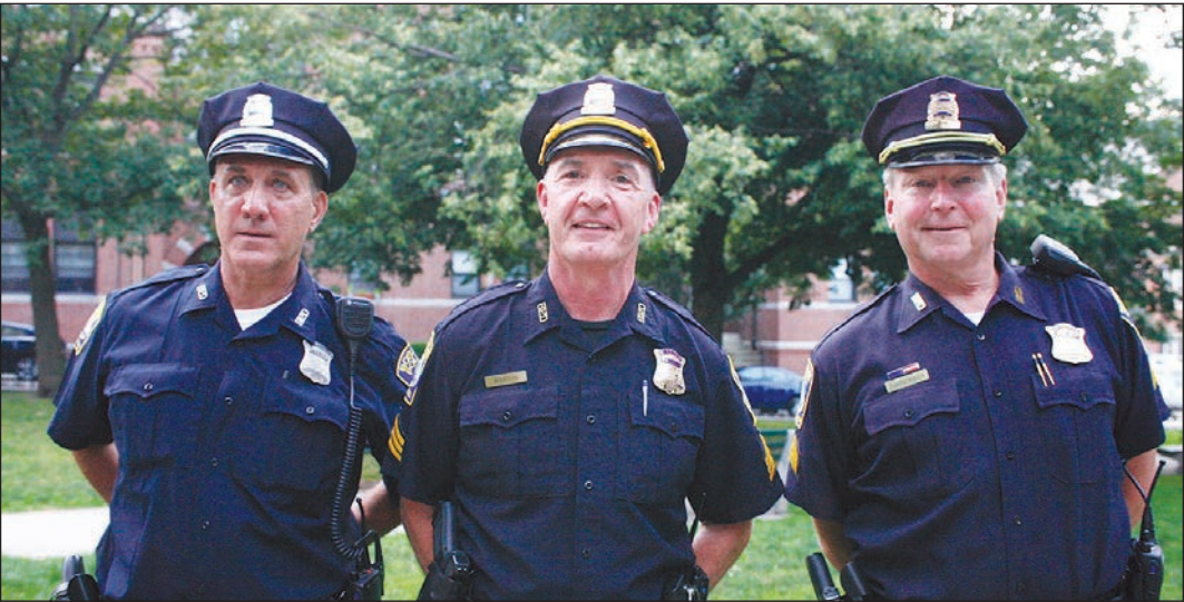
Officers from District A-7 were on hand during the Eastie Week kickoff in Brophy Park. The police brought the Boston Police Ice Cream Truck to the event.

teract. It is a great way to see all Eastie has to offer.” Community Partner, the East Boston YMCA provided activities while the District 7 Police Station brought the Police Ice Cream Truck.