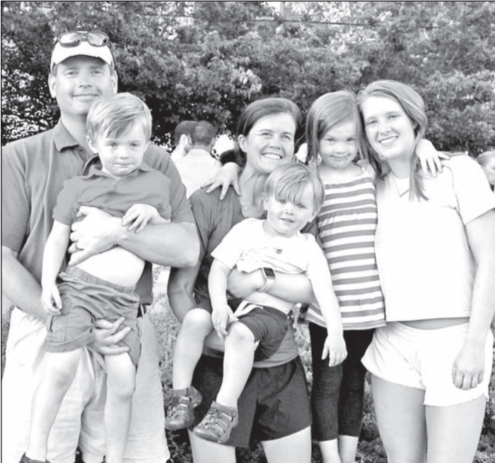
A family enjoying the party.