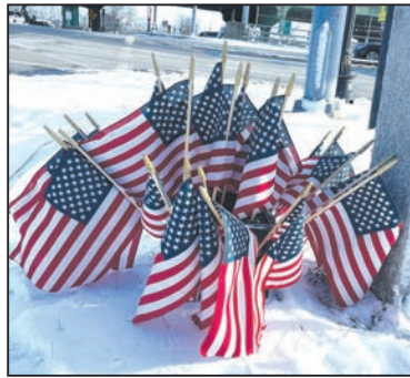
Some of the American flags on display to commemorate Martin Luther King, Jr. Day at the Daniel H. Solari Square.

The East Boston Chamber of Commerce placed a display of American flags to commemorate Martin Luther King, Jr. Day on Monday, Jan. 20, at the Daniel H. Solari Square outside the Chamber of Commerce office at 464 Bremen Street.