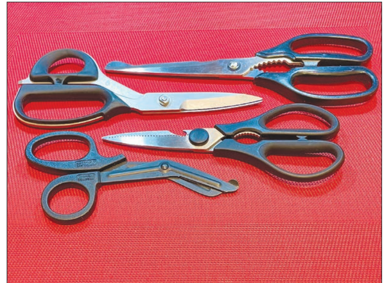
We use four types of scissors in our kitchen. Top to bottom, they are Korean scissors, heavy-duty poultry shears, utility scissors, and first-responder trauma shears.

kitchen tasks. We keep four different types in the kitchen. The most used is a pair of inexpensive kitchen scissors that stay in our dish drainer. (We use them so often that we don't bother to put them away.) These cut open