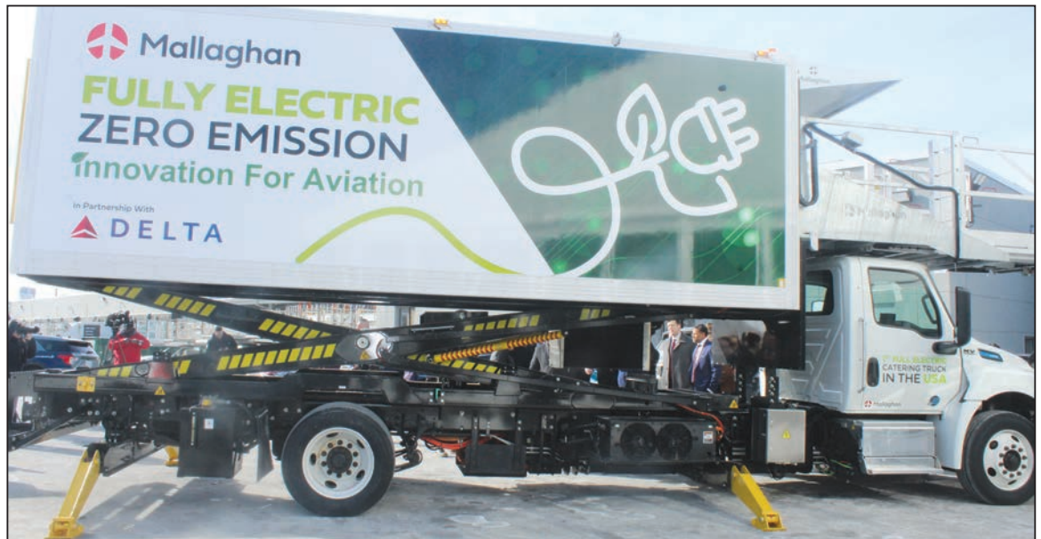
A photo of the new full electric catering truck, the first of its kind in North America.

Combining technical expertise with a deep understanding of customer requirements, Mallaghan designs and manufactures a comprehensive range of